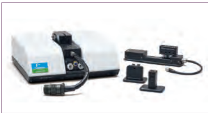
LAMBDA 265 with accessories

Microsampling Cell The ideal solution for samples smaller than the instrument beam size, the microsampling cell demagnifies the beam, increasing energy throughput.