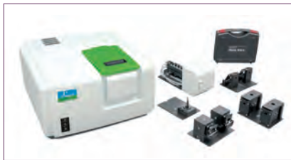
LAMBDA 365 with accessories