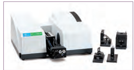
LAMBDA 465 with accessories